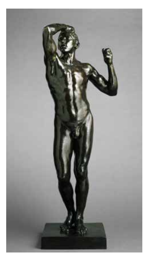
Auguste Rodin (French, 1840–1917). The Age of Bronze, medium-sized model, first reduction, 1876; cast 1967, bronze, 41 1/4 x 15 x 13 in. (104.8 x 38.1 x 33 cm), Brooklyn Museum, Gift of B. Gerald Cantor, 68.49

Join in the gentle practice of mindfulness meditation at the Figge Art Museum gallery where the French Moderns exhibition is on view. Practitioners will be quided in ways to calm the mind and body, and to bring awareness to the present moment. All are welcome to join in, whether new to meditation or not.