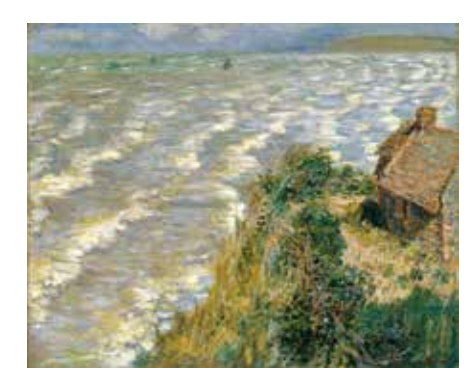
Claude Monet (French, 1840–1926), Rising Tide at Pourville , 1882, oil on canvas, 26 x 32 in. (66 x 81.3cm), Brooklyn Museum, Gift of Mrs. Horace O. Havemeyer, 41.1260.

For a complete list of exhibition sponsors, see page 25