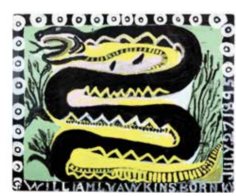
William L. Hawkins, Rattlesnake #3 , 1988, enamel and collage on Masonite, 48 \times 60 inches, Private Collection, Princeton. IL

Drawn from important public and private collections across the United States and Europe, William L. Hawkins: An Imaginative Geography includes 52 of Hawkins's most important paintings, some well-known pieces and others rarely seen. The exhibition covers all of Hawkins's favorite subject matter, including cityscapes, landscapes, exotic places, animals, current events, historic scenes and religious scenes. The exhibition also will include one of his rare freestanding sculptural assemblages. Organized by the Figge Art Museum, the exhibition is accompanied by a 192-page catalogue with essays by Susan M. Crawley, Jenifer P. Borum, Curlee R. Holton and others.